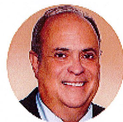
MAYOR JUAN CARLOS BERMUDEZ CITY OF DORAL