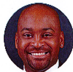
SENATOR OSCAR BRAYNON, II DISTRICT 36